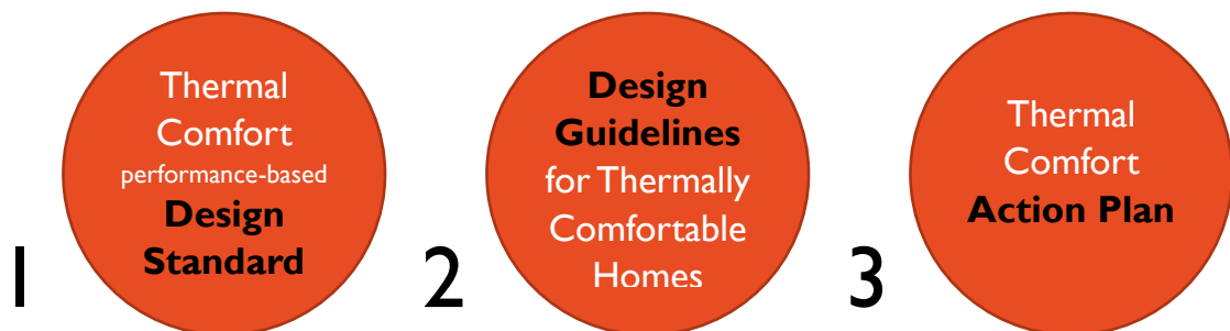
Figure 2 The three components of the program target standardization of design, dissemination of design and construction practices, and developing an action plan for realizing thermal comfort performance in affordable housing.