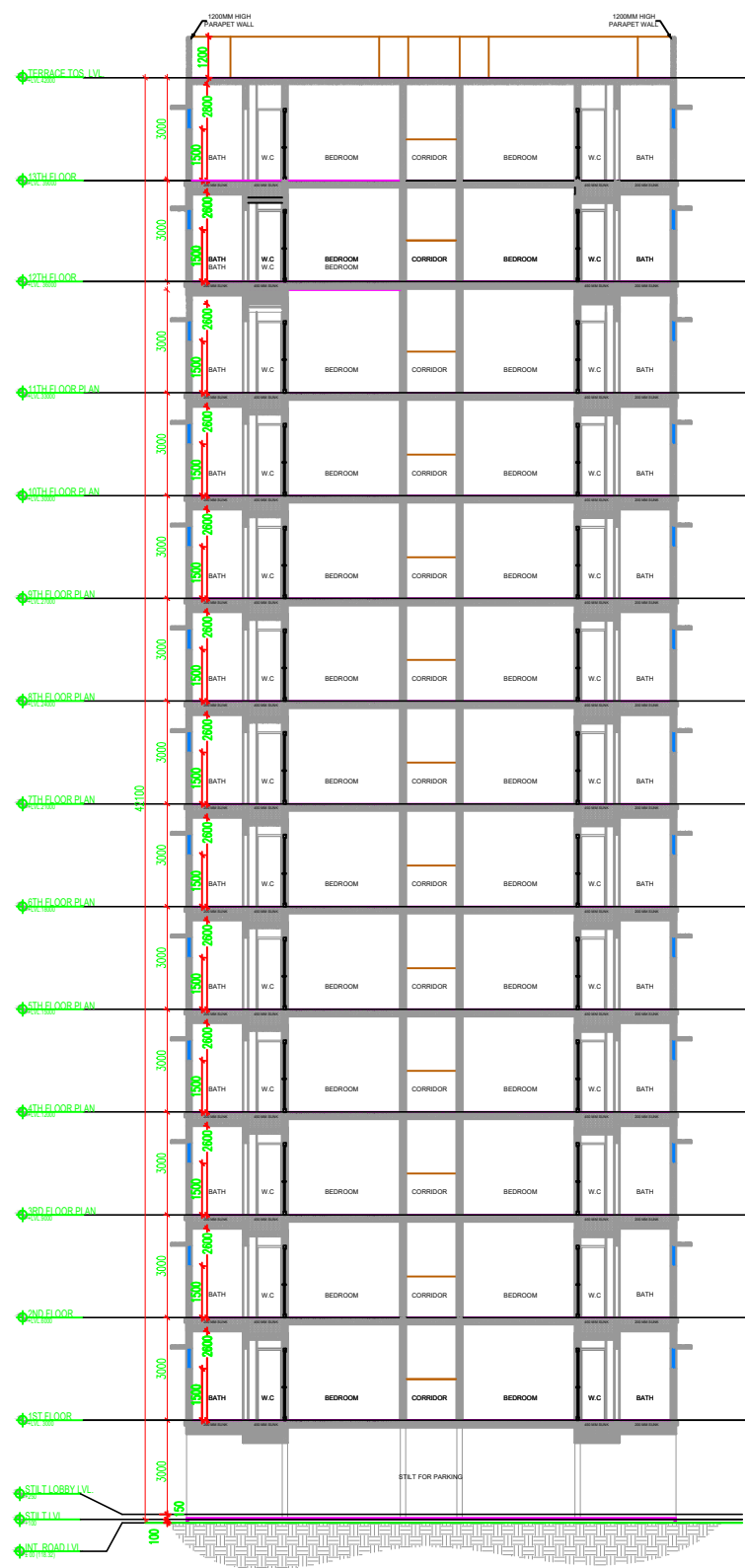
SECTION AT X-X'